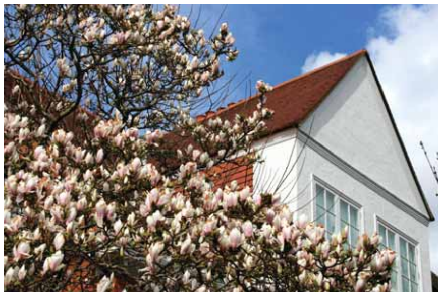
Trees in Bedford Park cannot be cut down, lopped or topped without permission

Sources of advice on trees are the Arboricultural Officer (see “Contact points”) or a tree consultant or contractor (tree surgeon). Consultants give professional advice on the health and/or safety of trees, concerns about structural damage to buildings and any matters requiring a report whilst a contractor undertakes pruning, removal and other management operations required (see “Contact points”).