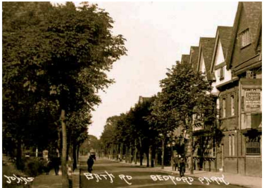
Bath Road - its trees have been decimated over the years

help of the two boroughs of Ealing and Hounslow, encourages the planting of broad-leaved forest species to preserve the character of the Conservation Area.